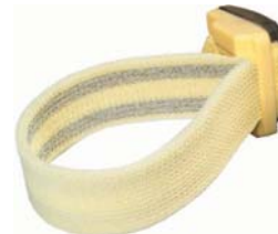
Light weight, water-resistant tags with our Soft Bracelet ensure comfort and safety for your infants.