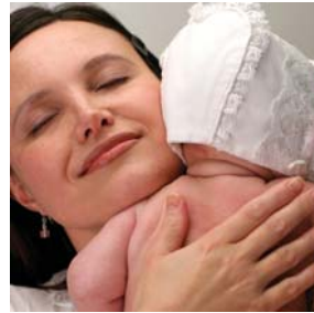
Mothers know their infants are safe and secure with Accutech's Infant Protection System.

With Accutech's Infant Protection System, you get affordable infant security solutions for complete peace of mind.