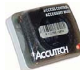
All tags incorporate a red pulsating light (LED) that provides a visual indication that the tag is active.