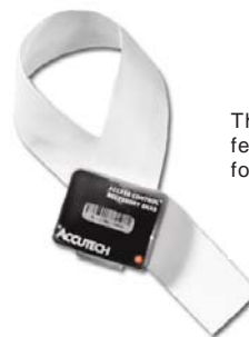
The ease-of-use and water-resistant features make the Cut Band ideal for pediatric units.